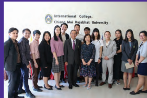
Yunnan Economics Trade And Foreign Affairs College