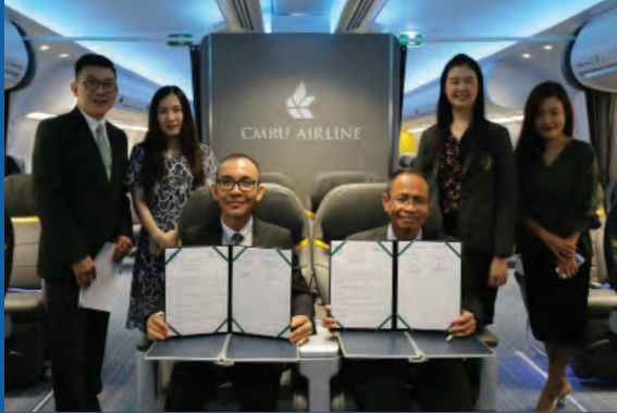
Thai Flight Training Company Limited