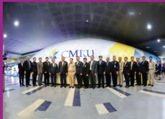
Launching Aircraft Mock-Up on 24 th August 2019