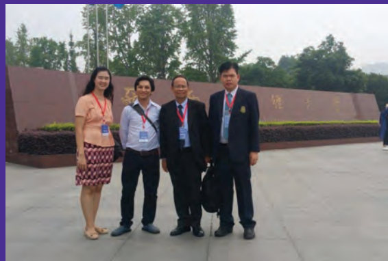
South Western University of Finance and Economics (SWUFE)