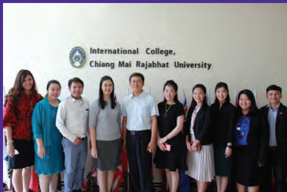
Guangxi University of Finance and Economics