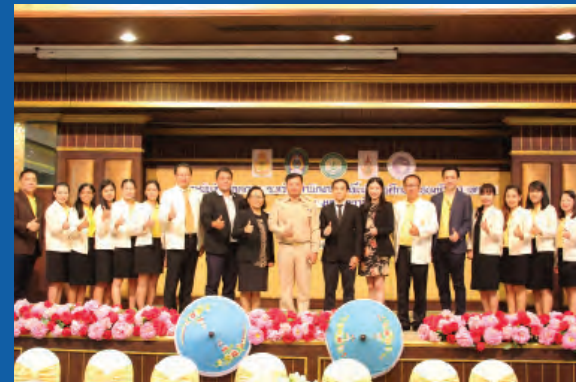
Chiang Mai Secondary Educational Service Area Office 34