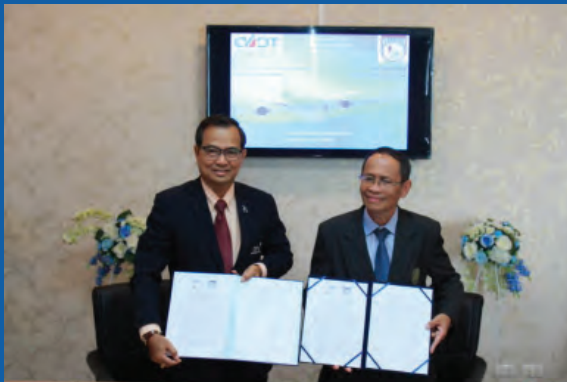
College of Aviation Development and Training Dhurakij Pundit University