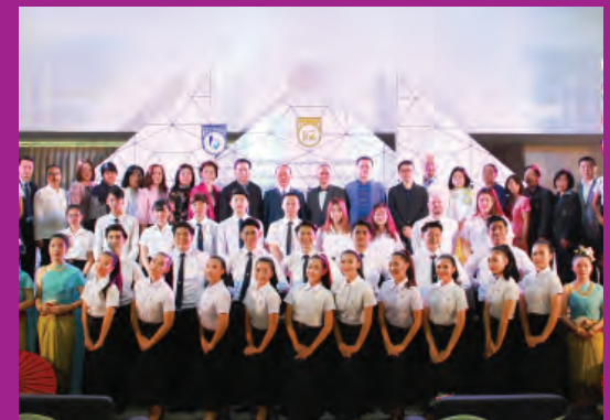
Celebrating 10 th Anniversary of the International College in 2019