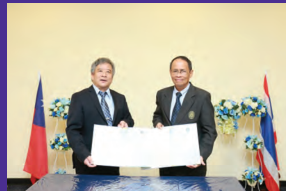
College of Humanities and Creativities, National Chin-Yi University of Technology (NCUT)