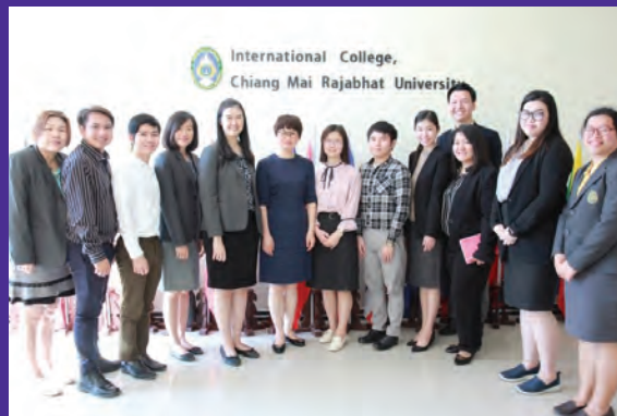
Zhejiang Yuexiu University of Foreign Languages