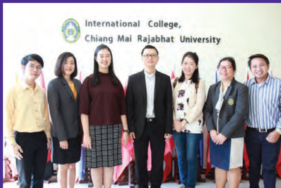
School of Foreign Language for Business, Guangxi University of Finance and Economics