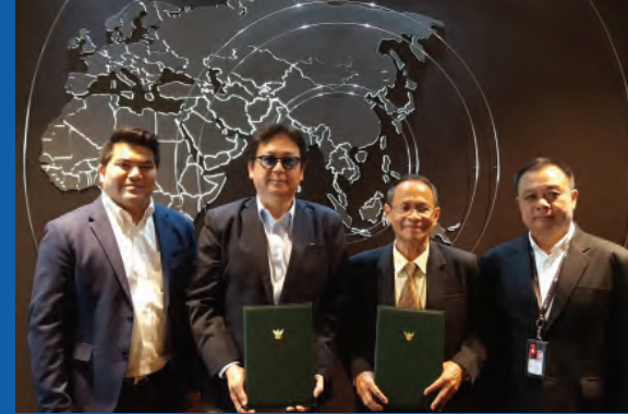
MJETS Company Limited